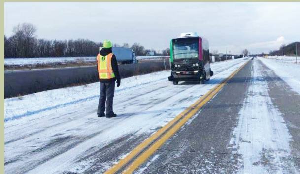
Snow and pedestrian testing in Minnesota by MN DOT