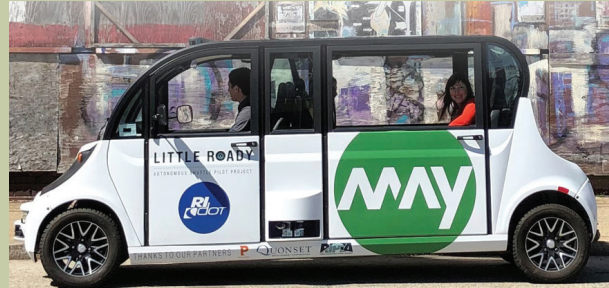
Little Roady autonomous shuttle project operated by RI DOT

Testers may evaluate private passenger vehicles, ride-for-hire services similar to Uber or Lyft, shuttles, buses, delivery vehicles, or trucks. The testing could be limited to a specific geographic area such as a college campus, resort, downtown, or office park. Testing may be limited to specific roads, types of roads, and paved and/or gravel surfaces. Certain weather conditions, daylight hours, or other conditions may also be defined. Testing is underway or complete in approximately 30 cities across the United States and 100 cities worldwide 3 .